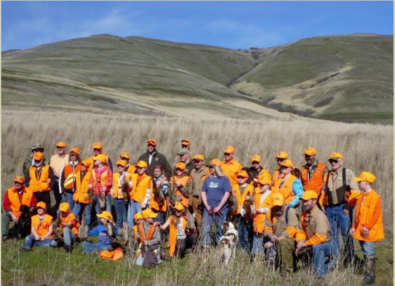
Previous Idaho Hunter Education Youth All Star Hunt at Flying B Ranch-- a combined effort of inspired youth, parents, volunteers, guides, and IDFG conservation officers.

have what we consider to be the BEST conservation officers to work with from the Idaho Department of Fish and Game . These COs go far beyond their "jobs" in spending their time and resources to help get young hunters into the field where they can learn about safety and ethics and begin their lives as respectable and educated hunters. Many times IDF&G brings out kids who don't have fathers or mentors to introduce them to hunting and so need that guiding influence and the opportunity to learn to hunt. Along that line, we have partnered with the First Hunt Foundation this past year and are very excited about what this new relationship will mean for the youth it serves.