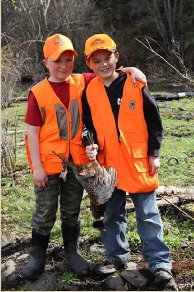
Happy young hunters from the All Star Youth Hunt Spring 2016 at Flying B Ranch

Our owner, a veteran himself, has always given very generously to veteran causes through the capacity of the Flying B Ranch. Over the years we have guided numerous hunters through programs such as Send a Vet and continue to do so. Just last month we began to work with Project Healing Waters to see how FBR can get involved with fundraising efforts and event hosting trips for disabled veterans learning to fly-fish and even tie their own flies!