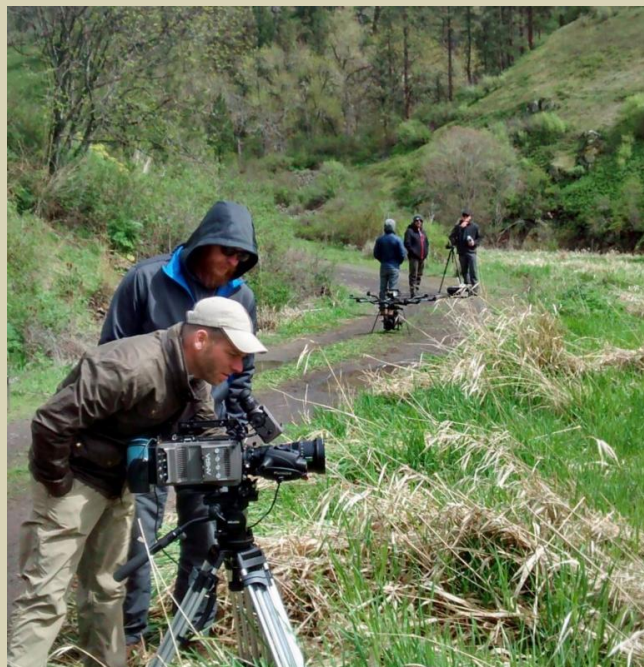
Filming project for the NRA on Flying B Ranch

Shooting Sportsman has selected the Flying B Ranch as the only new location to host one of their esteemed Readers & Writers Adventures this year! This hunt involve all the inclusive features that Flying B Ranch wingshooting adventures are famous for, but with the opportunity to hunt with Bruce Buck of Shooting Sportsman as well! This hunt is scheduled for December 3-7, 2016 and at last update there were 7 spots left. You can see the full Flying B Ranch hunt listing on ShootingSportsman.com and view a brief video about their Readers & Writers Adventures HERE .