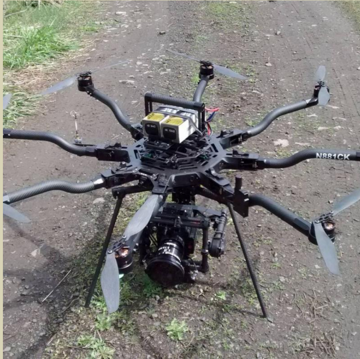
Drone used in filming of NRA project

The NRA (National Rifle Association) approached us first this past February about doing some filming with us for a new project they are working on that uses stunning filming techniques to illustrate the vast landscape that hunters are a part of, and to try to show what true "hunting" means. They were referred to us directly when searching for a place with majestic and diverse landscapes. We jumped at the opportunity to be involved with the NRA's efforts to promote the future of hunting in America and cannot wait to see the results of all the hard work that went into this week of filming. We will keep you posted on this!