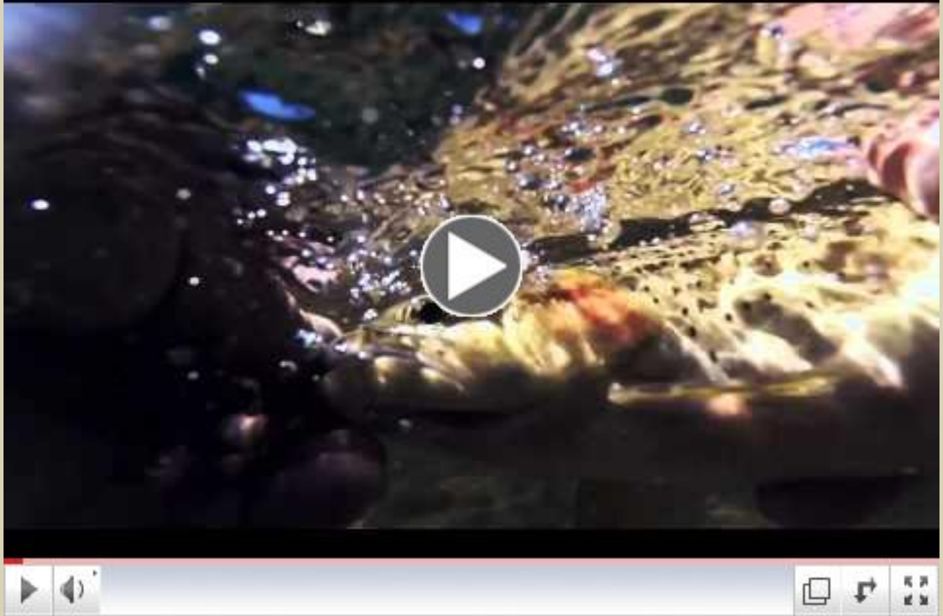
Backcountry Cutthroat Trout at Osprey Camp with Flying B Ranch