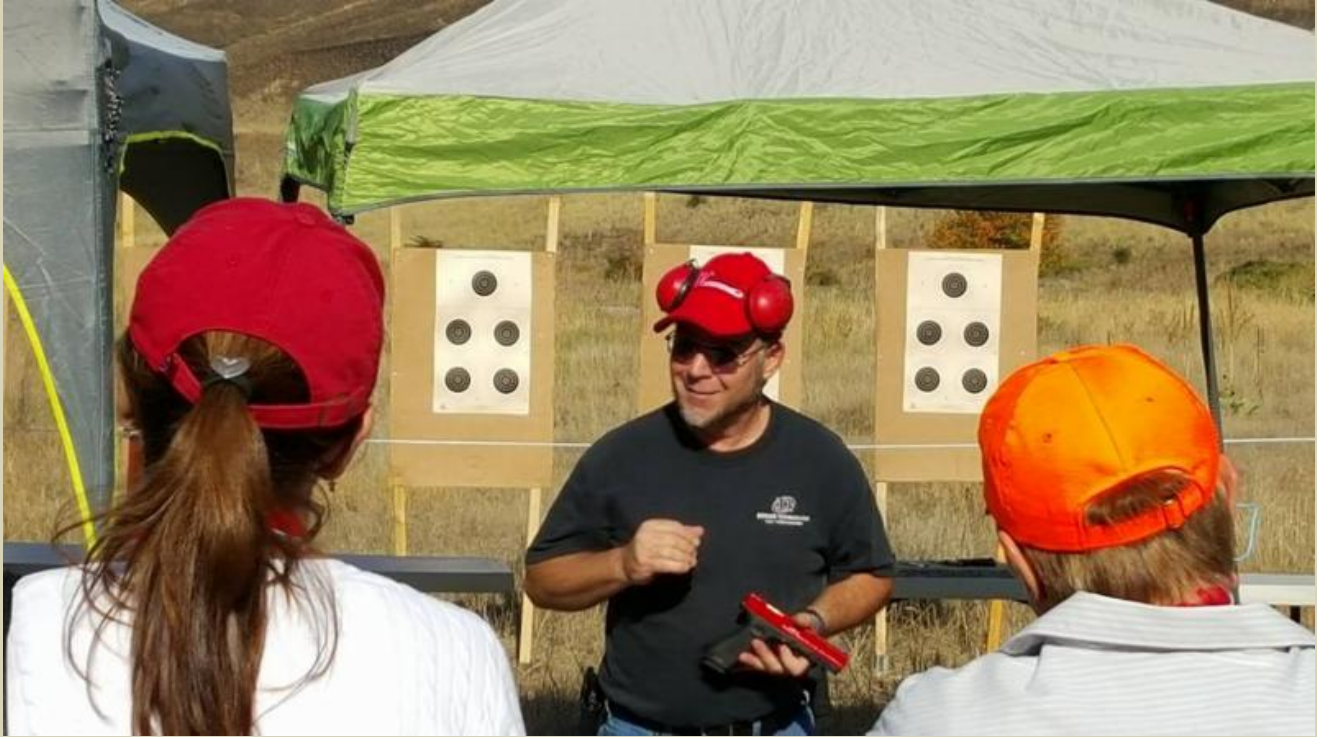
Hand gun instruction at last year's Women on Target by Friends of the NRA event at Flying B Ranch

This is just a sampling of what we are doing to give back to the hunting and fishing community both locally and nationally, as well to as veterans causes and other outreach programs. Be sure to keep an eye out for our Summer 2016 Edition Semi-Annual Report which will include a Giving Back Part 1 full feature on these programs and more, including how FBR is getting involved, and information on how you can also give back to important causes like these both nationally and at home.