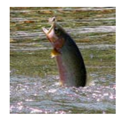
And for more tips on tying even smaller sizes 18-22, be sure to check out the video tutorial on Orvis' website.