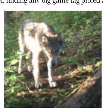
This inquisitive gray wolf image was captured by our Cuddeback game camera

$41.75 is almost unheard of... and to be able to get 2 over-the-counter (no worries of drawing odds)... yes, it's hard to believe. Many black bear hunters come to us because of the high percentage of colorphased bears in our area, meaning bears of brown, cinnamon, and rarely even blonde coat color. Hunters usually associate baiting with bear hunting because it is the most effective means of bear harvest. We conduct bear hunts over bait because it is highly successful. In fact, bear hunting is our most successful big game hunt near one of our bear baits in 2014 we offer (deer being another high