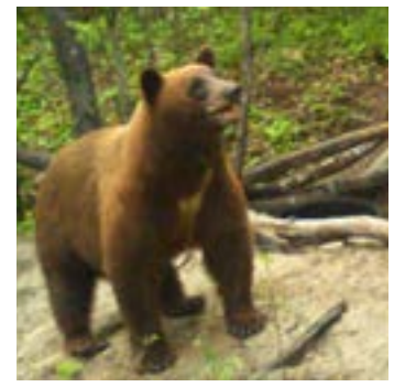
This beautiful color phased black bear was recorded on our game camera at a hunt you could hunt a different productive bait location this Spring

accessed by means of atv, walking, horseback riding, and even river raft. During any given week I can take a black bear hunter into the field by all these means. Crossing the Lochsa River ("Lochsa" being Nez Perce native language for "rough water") in a self-bailing whitewater