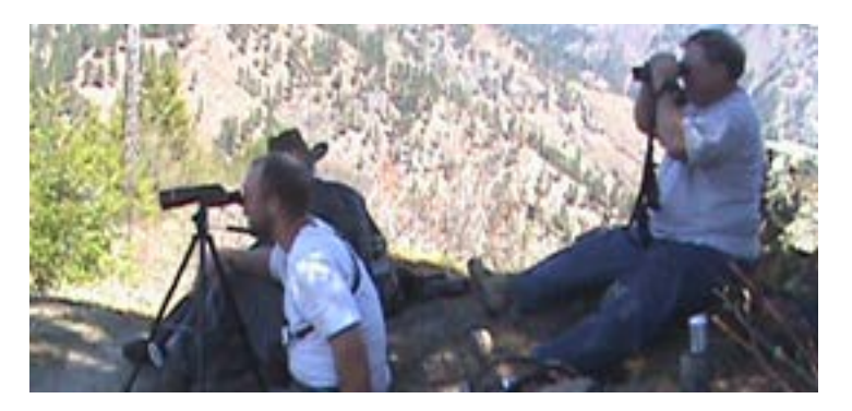
The hunters and I glass a vast amount of Selway Wilderness country from a high point above our Weasel bear camp.